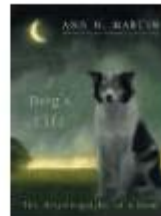
A Dog's Life by Ann M. Martin