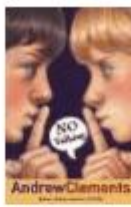
No Talking by Andrew Clements