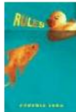
Rules by Cynthia Lord