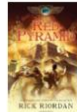
The Red Pyramid (New) by Rick Riordan