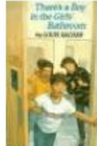
There's a Boy in the Girl's Bathroom by Louis Sachar