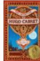
The Invention of Hugo Cabret by Brian Selznick