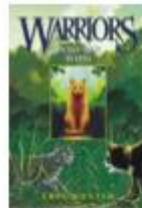
Warriors Into the Wild by Erin Hunter