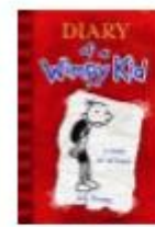
Diary of a Wimpy Kid #1 by Jeff Kinney