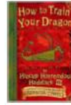
How To Train Your Dragon #1 by Cressida Cowell