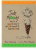
Judy Moody No. 1 by Megan McDonald