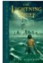
Lightning Thief by Rick Riordan