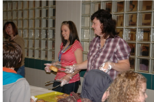
Pastries with Parents Volunteers